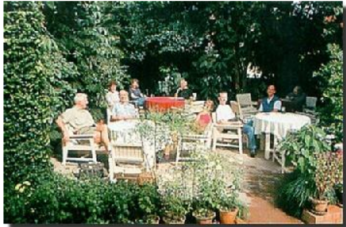
The ground level garden seating area where guests can eat a meal or have a coffee.

The Internet is now available widely in Nepal, primarily through the cell network, but still not used by a large percentage of the citizens (40% - 2018 statistic). The country is not a wealthy one, being on one of the ten poorest countries in the world. Most of its citizens live and work in rural areas, typically earning their living from agriculture. In the city of Kathmandu and in a most the other major tourist destinations in the country, the Internet is available through numerous Internet cafes in popular tourist areas, WIFI at hotels and restaurants, and for those staying longer, through the cell network.